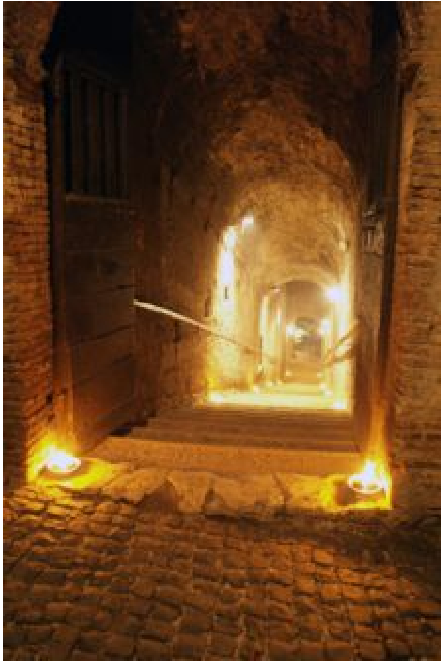
A candle-lit stairway leads to the banquet room at the “Castello di Lunghezza” in Rome.