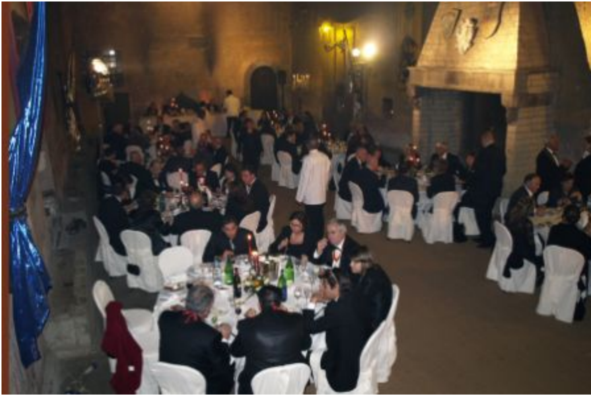
The O.B.S.S. banquet at the Castello di Lunghezza, a 700-year-old castle in Rome, Italy, followed the investiture.