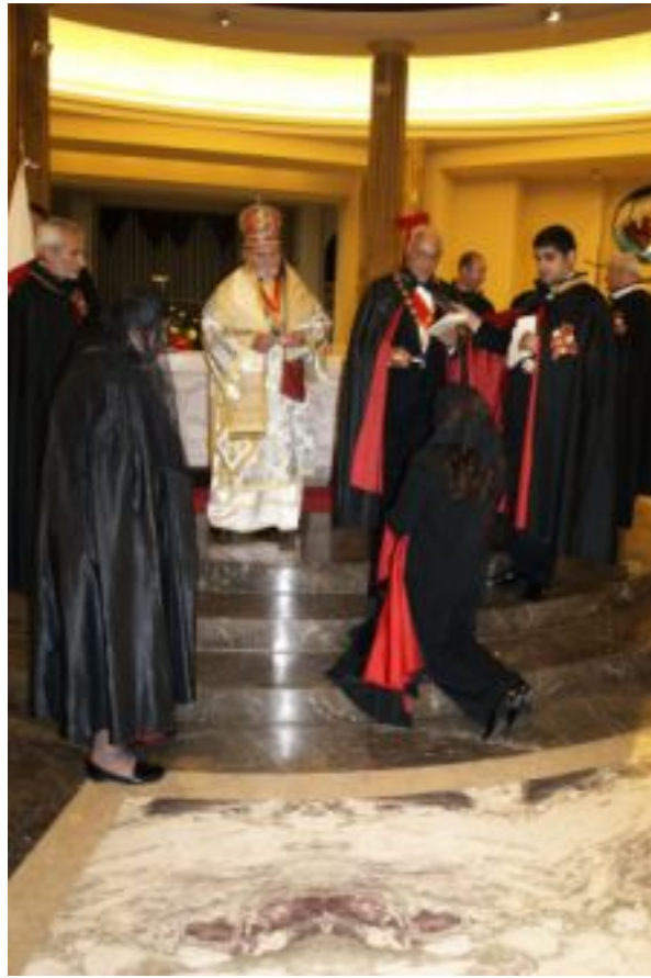
Investiture at the Cathedral of Saint Paul in Rome, Italy.