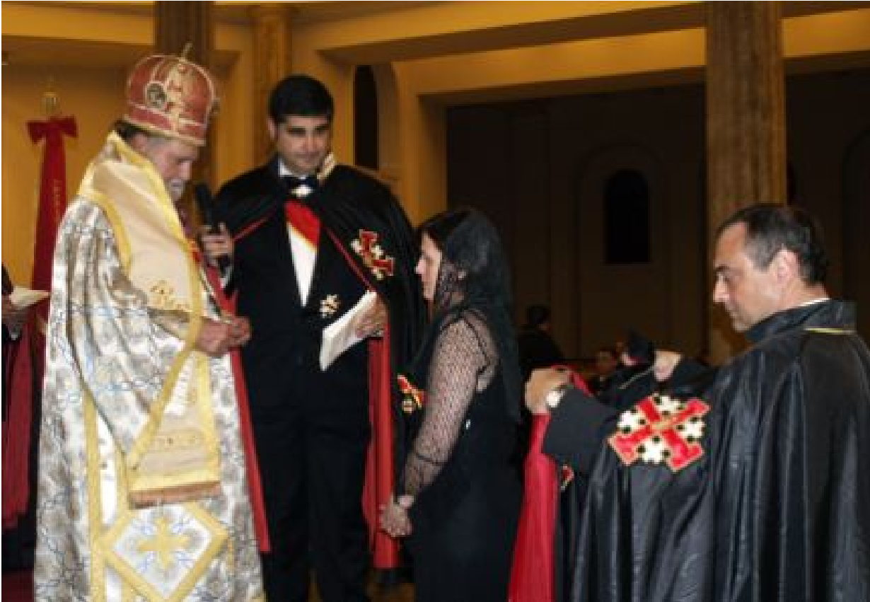
Archbishop Haralambos invests a Dame into the Order of the Holy Sepulchre.