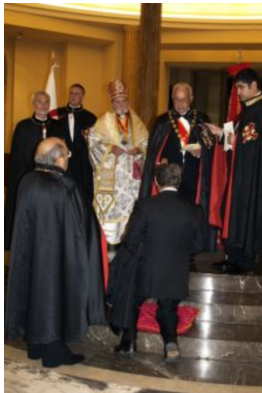
An investiture in progress A Holy Christian Ceremony.