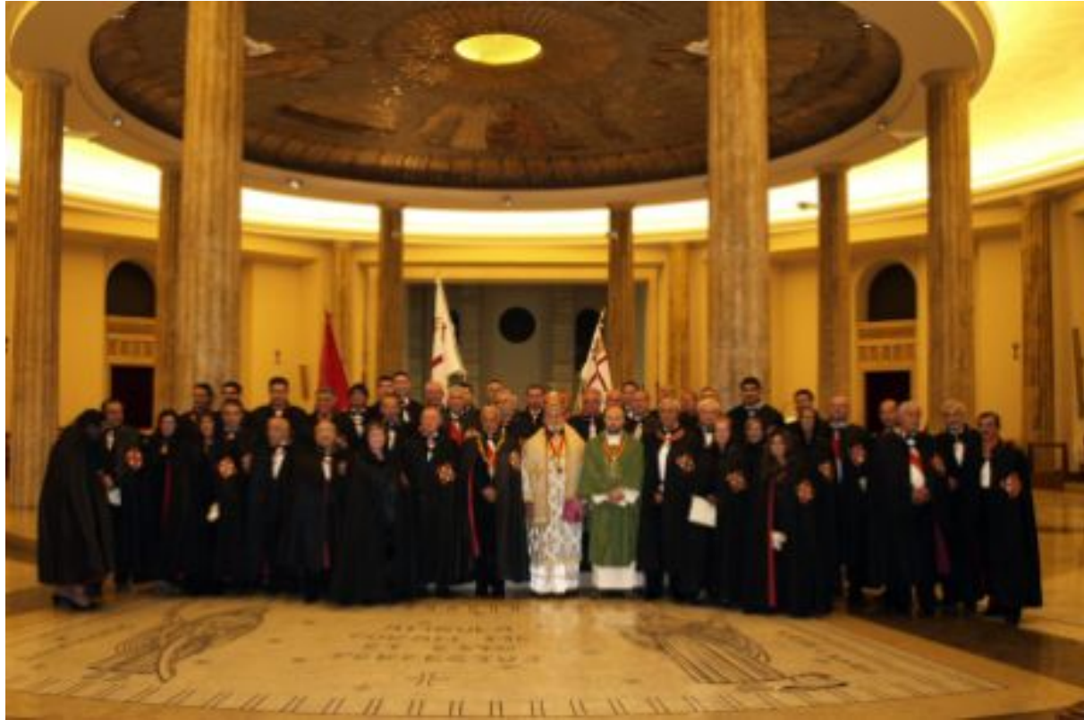
The Majesterium and Knights of the Malta O.B.S.S. are at the Altar at Saint Paul's Cathedral in Rome, Italy.